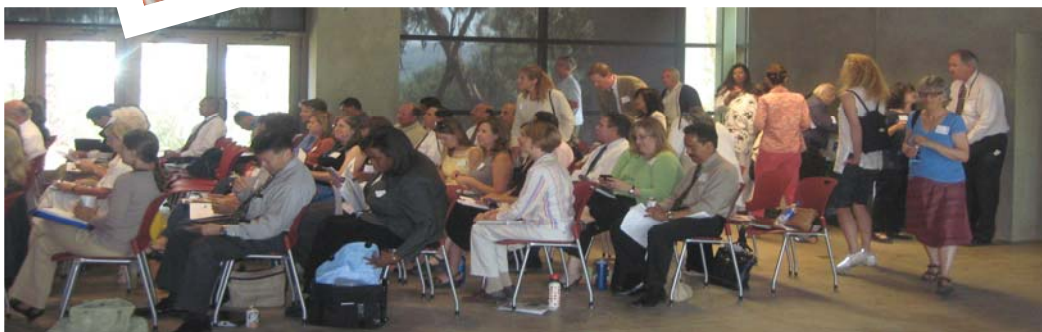
About 70 stakeholders came to listen to the accomplishments and other program highlights of the City