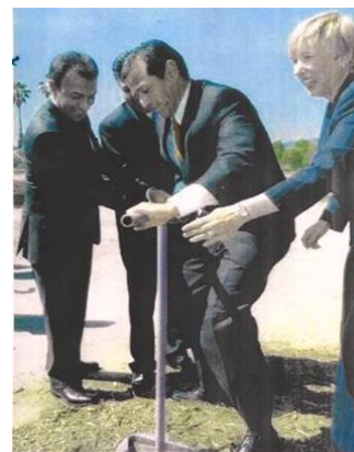
Mayor Villaraigosa activates recycled water at Woodley Golf Course in the Sepulveda Basin.